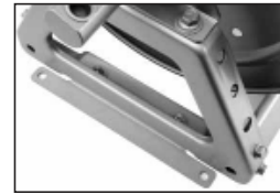
Optional External Mounting Brackets part no. 9906.0027. Add 2-1/2" to the X dimensions shown in the chart.