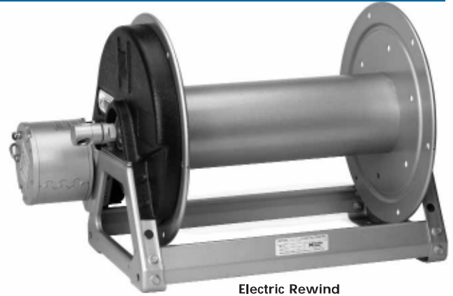
Electric Rewind Standard Configuration Shown